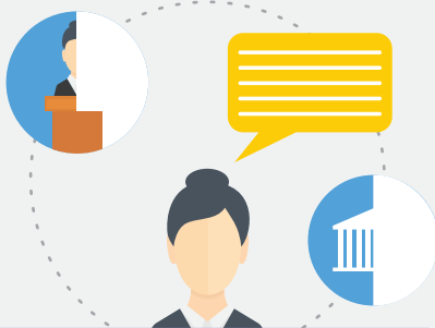
JUSTICE RUTH BADER GINSBURG

Some people think fair use is a minor exception or a marginal carve-out from the expansive protection for authors, but fair use is a fundamental right .